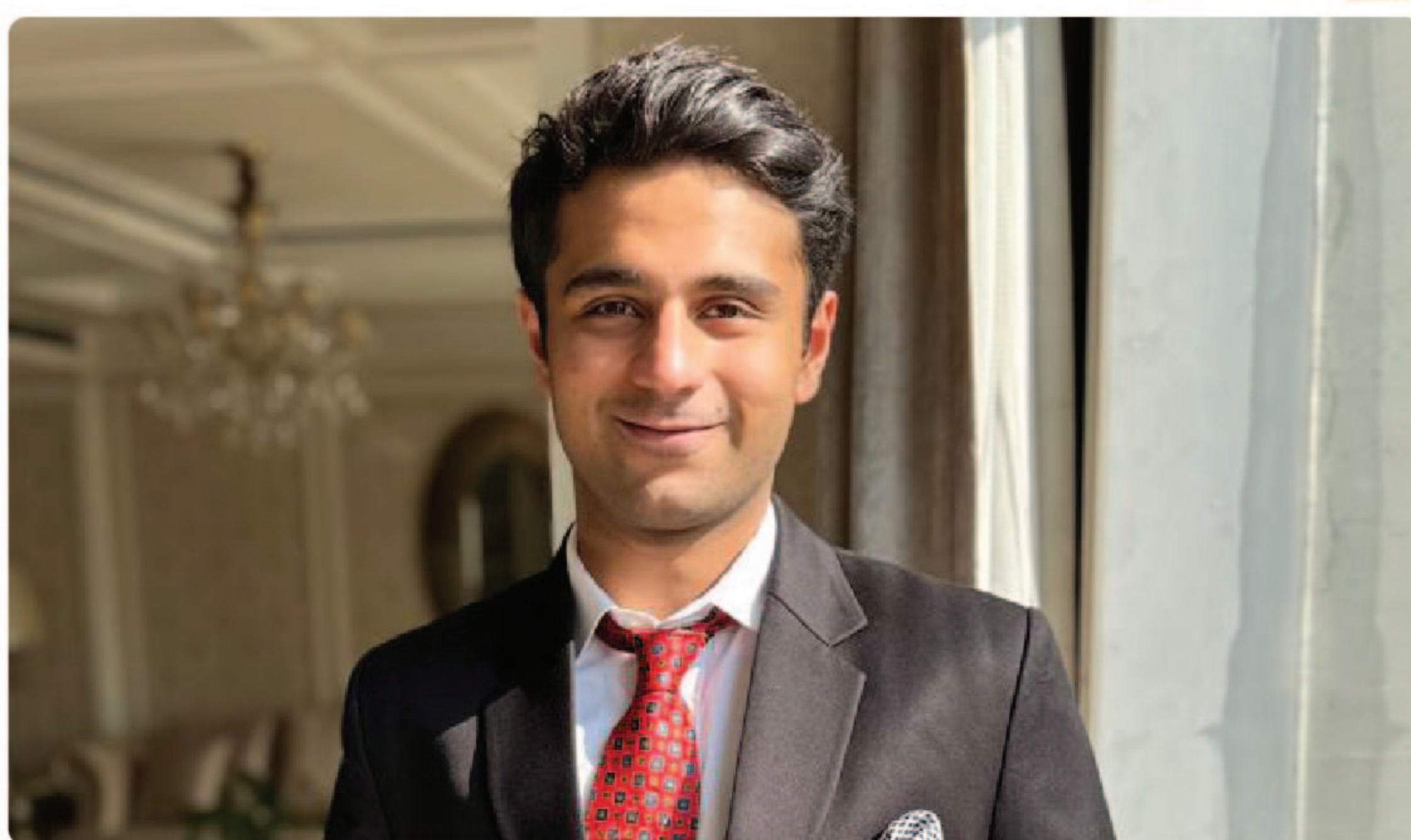
Member of the Governing Body